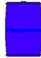
Type 2, L Ring