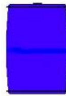
Type 2, L Ring