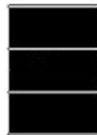
Type 1, Steel